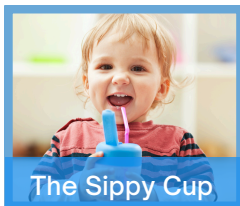
The Sippy Cup